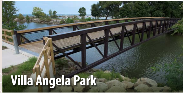
Villa Angela Park