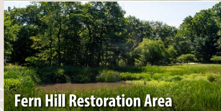
Fern Hill Restoration Area