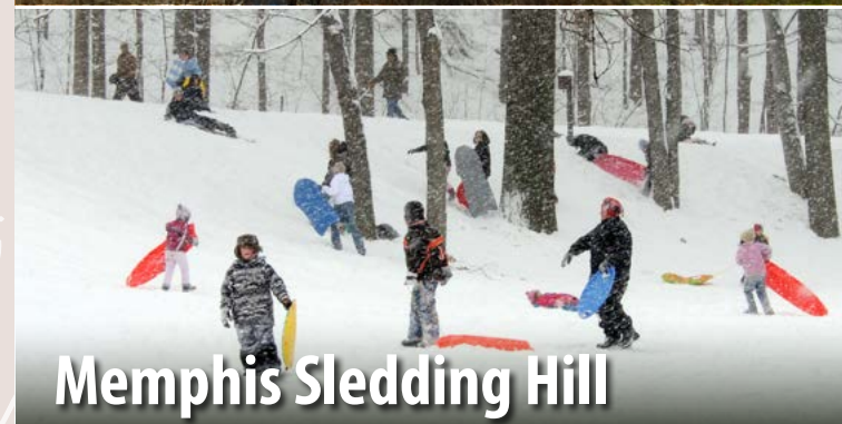
Memphis Sledding Hill