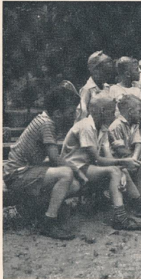
"Trailside Explorers" at Rock of The Trailside Mu