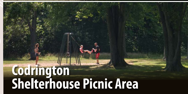
Codrington Shelterhouse Picnic Area