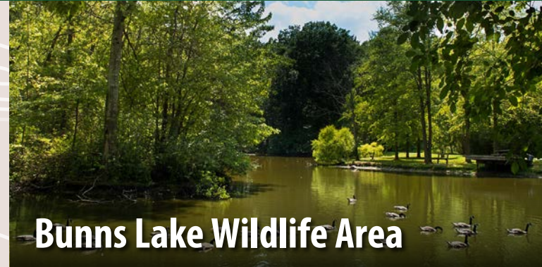
Bunns Lake Wildlife Area