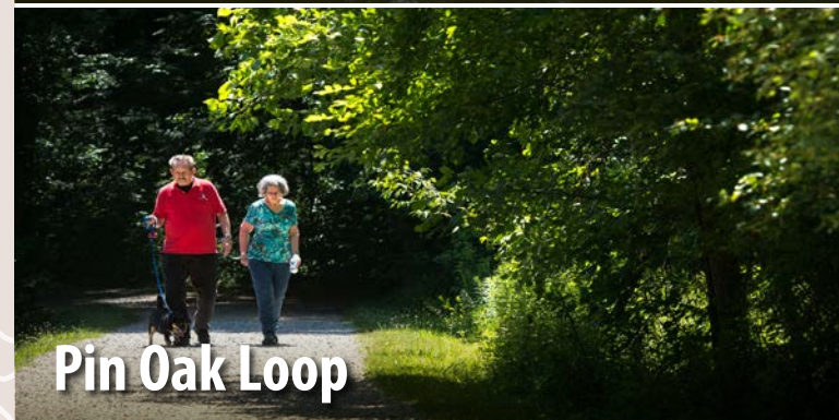
Pin Oak Loop