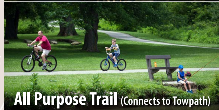
All Purpose Trail (Connects to Towpath)