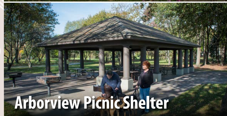
Arborview Picnic Shelter