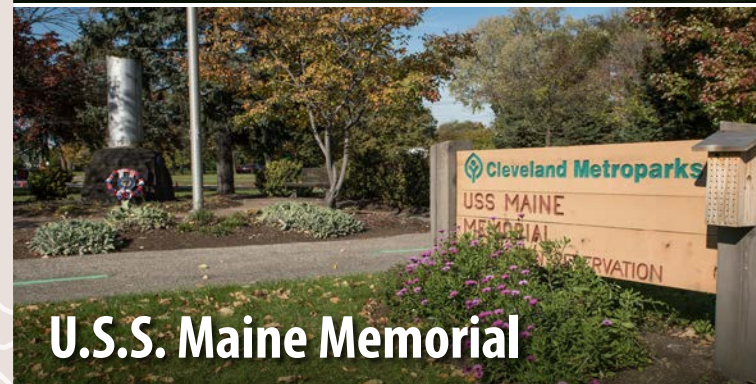
U.S.S. Maine Memorial