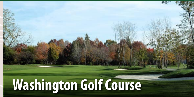
Washington Golf Course