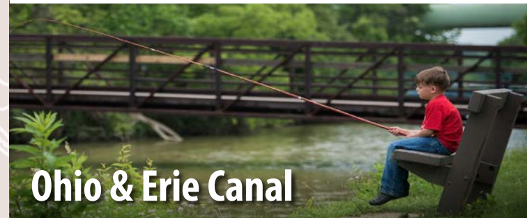
Ohio & Erie Canal